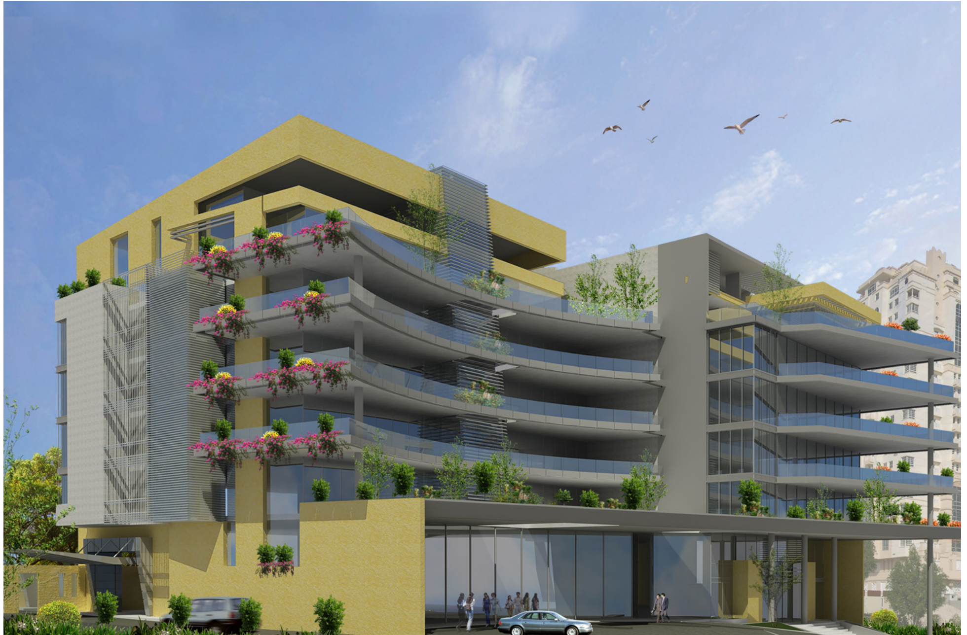
SARBA 760 // GREENYARD PROPERTIES